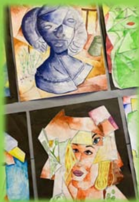
Artwork displayed in Mr Grange’s classroom