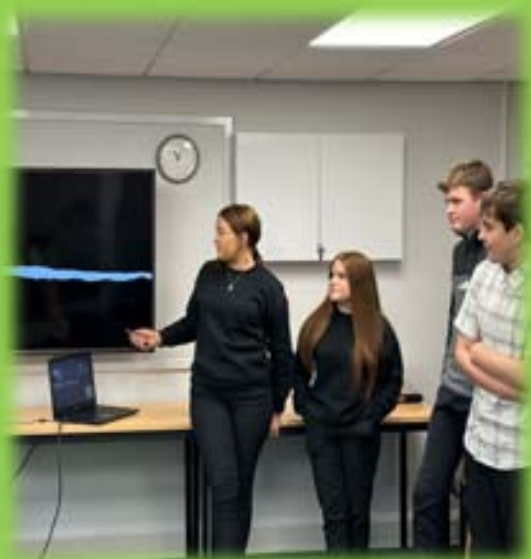
Work Experience at ProjX Regeneration