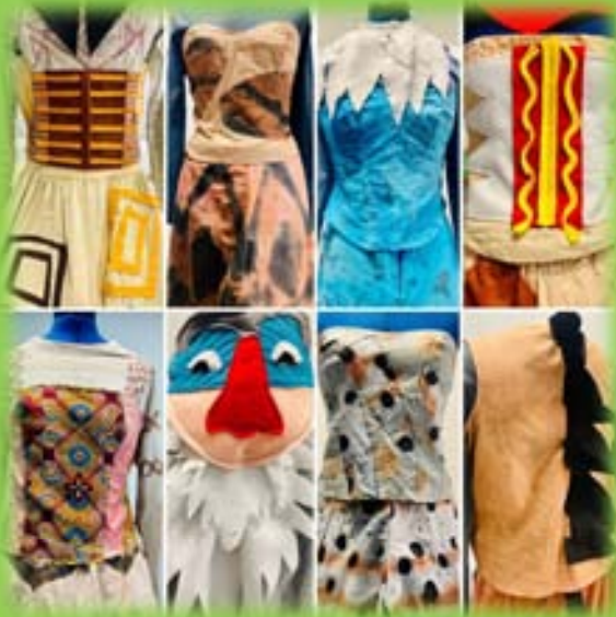
Costumes from 'The Lion King' performance which took place at Millom School on 31 January 2024.

“Self-belief and hard work will always earn you success.”