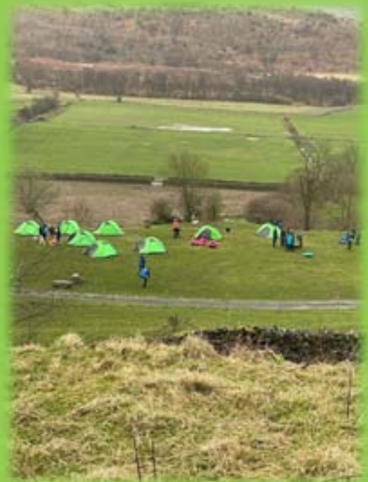
Duke Of Edinburgh Award

See our Facebook page for more pictures.