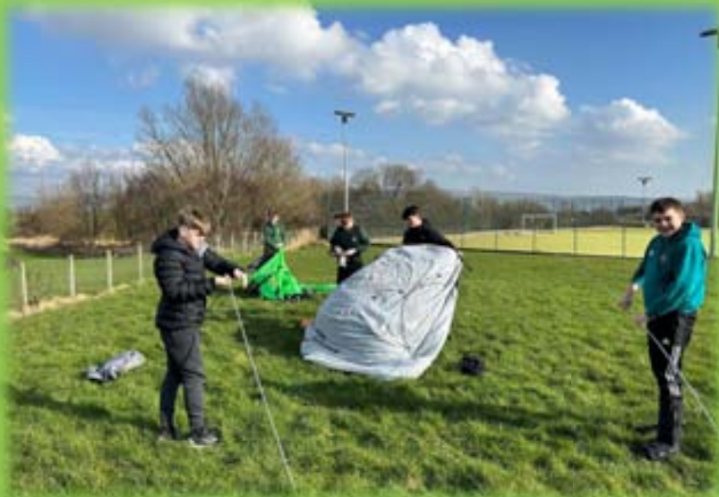
Team Work—Duke of Edinburgh Award Enrichment