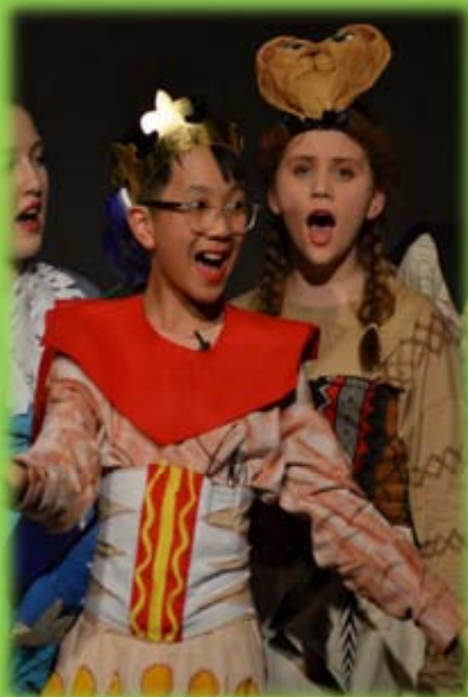
Millom School's Production of The Lion King

Lost Property—Please remember to label your child items of uniform, pencil cases etc.